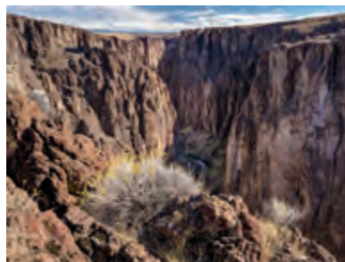
SEPTEMBER OWYHEE CANYONLANDS