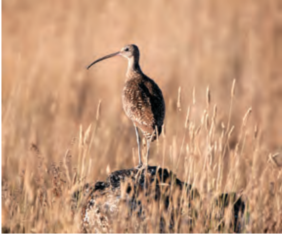
Long-billed curlew.

We drove down from sunrise on Steens Mountain ... to the break over Hart Mountain into North Warner, where we could look down on lakes ... shimmering in the morning breezes .... We stood facing such beauty as if given something from a dream about what the world could be, if we let it, alive and significant without us.