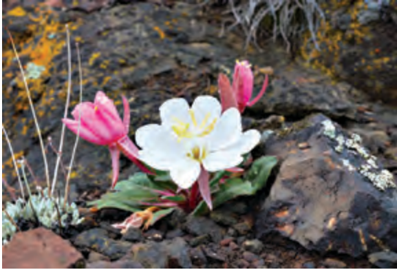
Desert evening primrose.

A river is a different kind of mystery, a mystery of distance and becoming, a mystery of source. Touch its fluent body and you touch far places. You touch a story that must end somewhere but cannot stop telling itself, a story that is always just beginning.