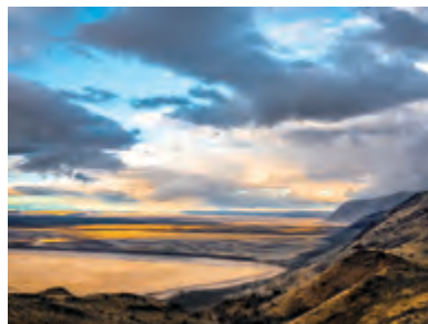
JANUARY HART-SHELDON REGION

Oregon Natural Desert Association 50 SW Bond Street, Suite 4 Bend, Oregon 97702 541.330.2638 | www.onda.org