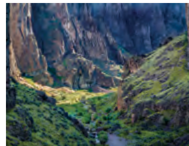
MARCH OWYHEE CANYONLANDS