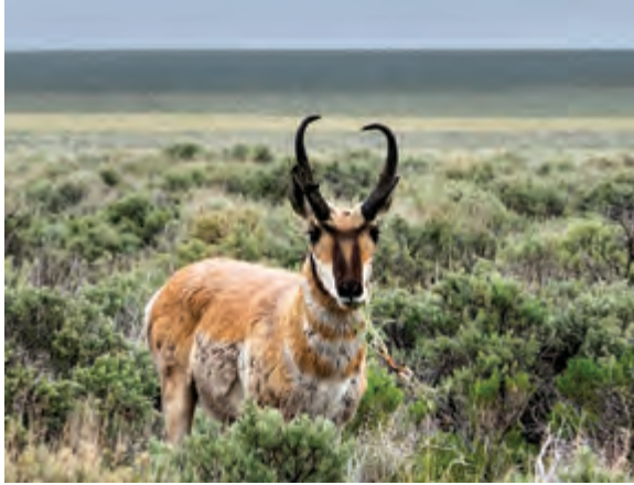
Pronghorn.

The desert is subtle, secretive in color and movement. It doesn't brandish. To know the high desert requires diving deep into the sagebrush ocean, looking closely, taking time, tasting silence.