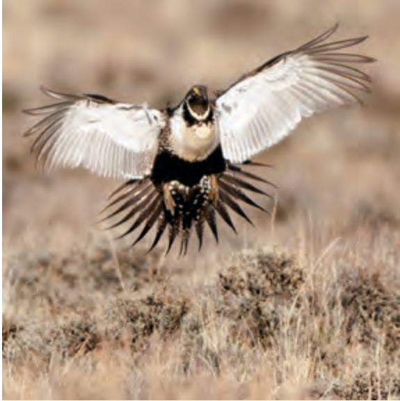
Greater sage-grouse.

As humans, we distinguish ourselves through art, architecture and invention. But equally important, and perhaps more difficult, is for us to agree that we have been gifted natural wonders that cannot be improved upon and to leave these places wild. It is clear that the Owyhee Canyonlands deserves such an honor.