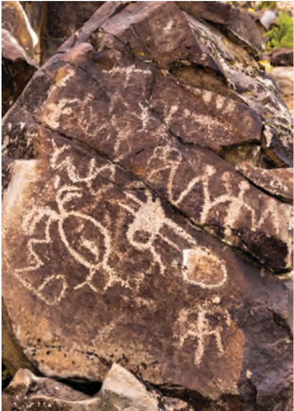
Petroglyphs, Hart-Sheldon Region.

And you discover where music begins before it makes any sound, far in the mountains where canyons go still as the always-falling, ever-new flakes of snow.