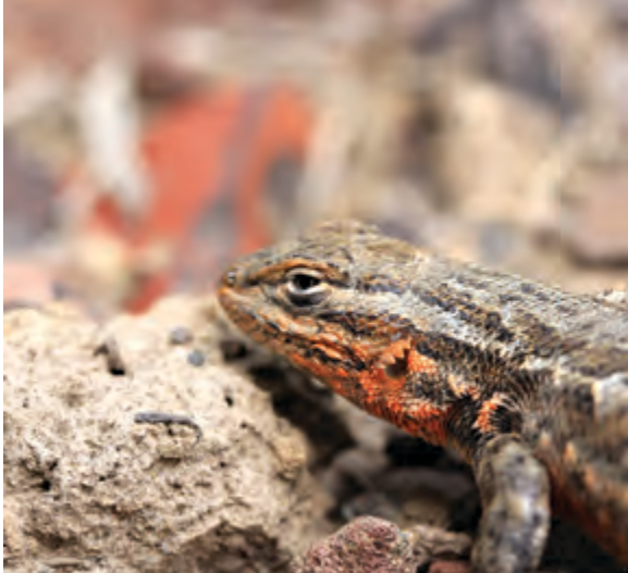
Eastern sagebrush lizard.

The old, old junipers knit the entire scene together. I don't believe trees see or feel or speak in the conventional sense, but they can tell us much about a place and something, maybe, about ourselves.