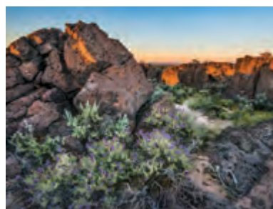
JUNE OREGON BADLANDS