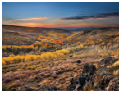
OCTOBER STEENS MOUNTAIN