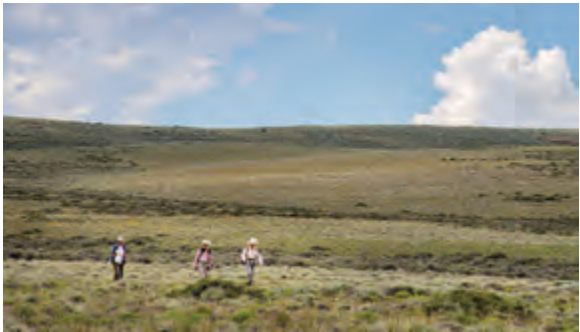
Sheldon National Wildlife Refuge.

My hope for the future of the Hart-Sheldon area is that there will always, always be pronghorn gliding across the landscape and sage-grouse strutting on their leks.