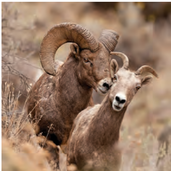
Bighorn sheep.

There is only now, and now is perfect. And later there will be the memory of perfection – not an empty superlative-laden wishful platitude, but a visceral knowledge of what it was like – the sensations and scents and sounds and silences, and the immense and beautiful and humbling poetry of it all.