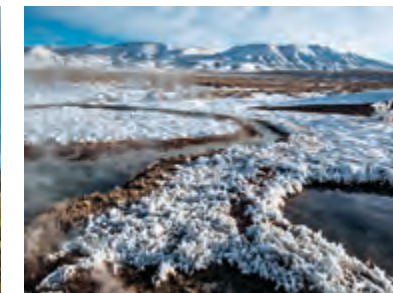
DECEMBER ALVORD DESERT