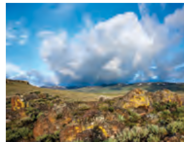
NOVEMBER HART-SHELDON REGION