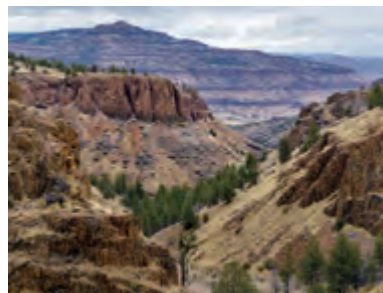
FEBRUARY SUTTON MOUNTAIN