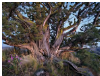
MAY SUTTON MOUNTAIN