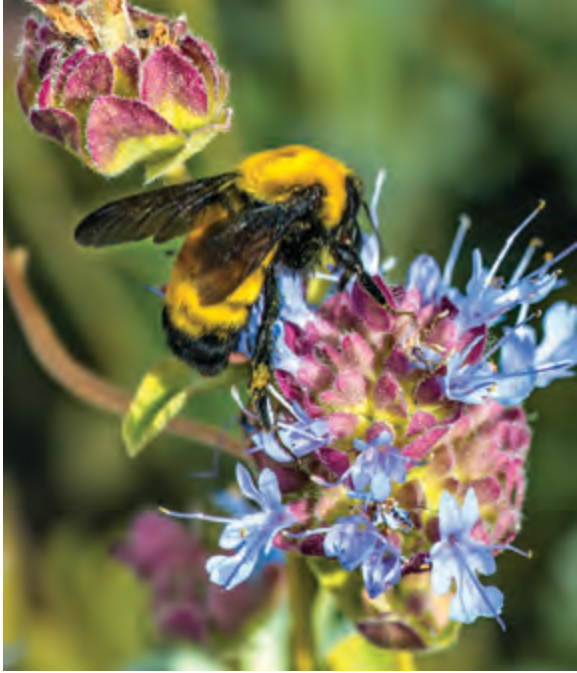
Purple sage.

Sometimes, in a desert landscape, a landscape without consciousness, emptier of intellect than any other landscape I have ever seen, I think I can feel emotion lying like heat on the surface of the sand and seeping into cracks between boulders.