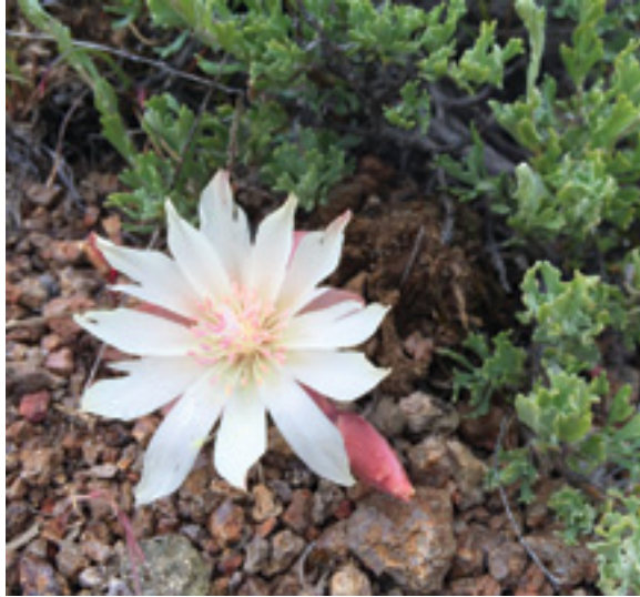
Bitterroot, Lewisia rediviva .

In our increasingly hectic lives, it is our wildest places that provide a liberating reminder that we are but a part of the vast web of life, and in such places, on equal footing with a beaver damming a stream or a bee pollinating a flower. These humbling reminders will be ours as long as we keep public lands wild and open to all Americans.