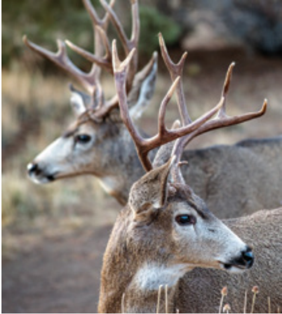
I felt the overwhelming presence of empathy as if the trees somehow cared for me, were praying for me because I was so temporary, fragile; because my metabolism was so fast that I missed the essence of light, wind, snow, and time. They watched mountains dissolve, felt in their roots what I could only understand as an abstract idea.

JANUARY 1 2 3 4 5 6 7 8 9 10 11 12 13 14 15 16 17 18 19 20 21 22 23 24 25 26 27 28 29 30 31