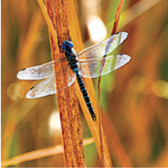
Blue-eyed damner.

But once we have tasted far streams, touched the gold, found some limit beyond the waterfall, a season changes and we come back changed but safe, quiet, grateful.