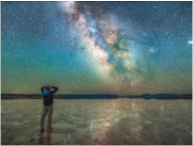
DECEMBER ALVORD DESERT