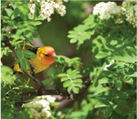
Western tanager.

There is an otherness to the high desert. Something momentous and sacred in the purity of the silence. The relationship of man and nature still seems to be in appropriate proportion. So long as this balance is maintained, both seem to have an equal shot at longevity, sustainability.