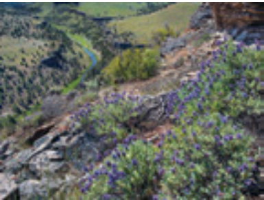
JUNE SOUTH FORK CROOKED RIVER