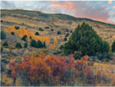
OCTOBER GREATER HART-SHELDON REGION