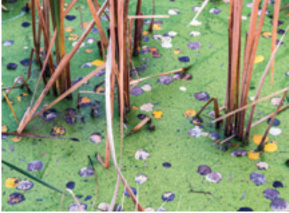
Duckweed, Wolffia sp.

Those who haven't the strength or youth to go into it can simply contemplate the idea, take pleasure in the fact that such a timeless and uncontrolled part of earth is still there....We simply need that wild country available to us.... For it can be a means of reassuring ourselves of our sanity as creatures, a part of the geography of hope.