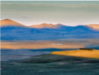
MARCH GREATER HART-SHELDON REGION