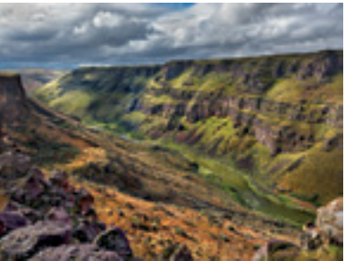
AUGUST OWYHEE CANYONLANDS