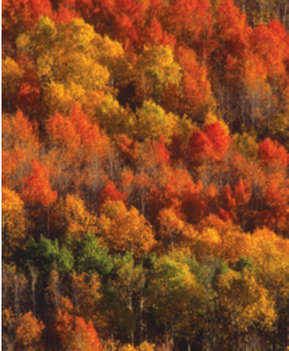
Aspens, Steens Mountain.