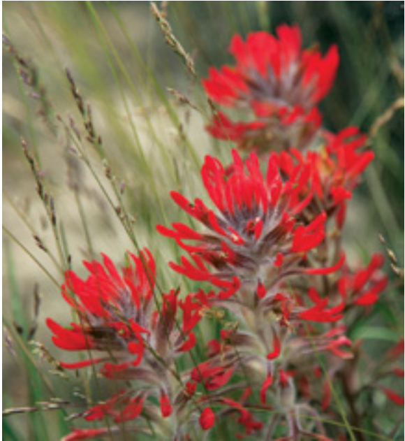
Indian paintbrush, Castilleja sp.

The canyon is a vault of light, its streaked volcanic walls rising hundreds of feet above me. ... a rippling, wavering river of light follows the river that follows the stone as it wears the stone away. ... It slips away into its future, where it already is, and flows steadily forth from up the canyon, a fountain of rumors from regions known to it and not to me.