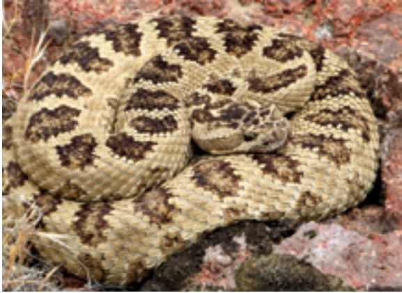
Great Basin rattlesnake.

Aridity frees light. It also unleashes grandeur. The earth here wasn't cloaked in forest, nor draped in green. ... Desert beauty was "sublime" in the way that the romantic poets had used the word ... rugged mountain faces, not reassuring but daunting nature, the earth's skin and haunches, its spines and angles arching prehistorically in sunlight.