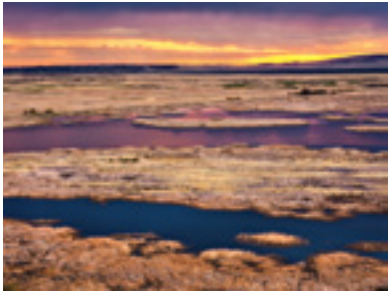
JANUARY MALHEUR WILDLIFE REFUGE

Oregon Natural Desert Association 50 SW Bond Street, Suite 4 Bend, Oregon 97702 541.330.2638 | www.onda.org