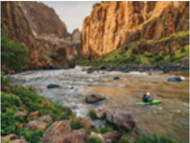
APRIL OWYHEE CANYONLANDS