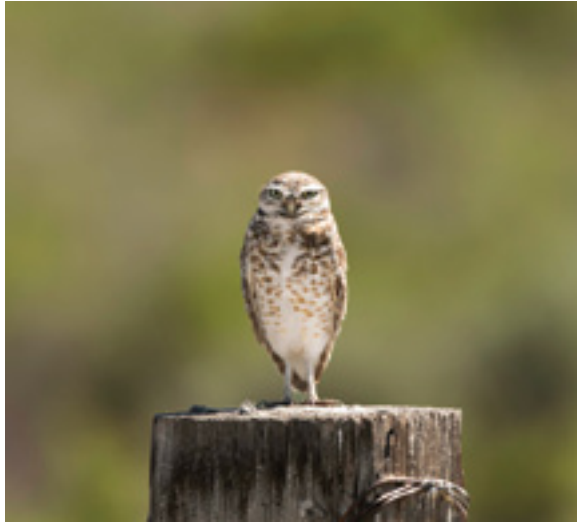
Burrowing owl.

...the birds that dipped and dove around us connected the landscape to marshes up and down three continents, from Argentina to Siberia. Malheur is one of the critical feeding sites along the Pacific Flyway, the migratory route of millions of waterfowl and shorebirds. With their flights and their songs, these birds tie continents together.