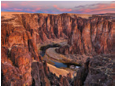
SEPTEMBER OWYHEE CANYONLANDS