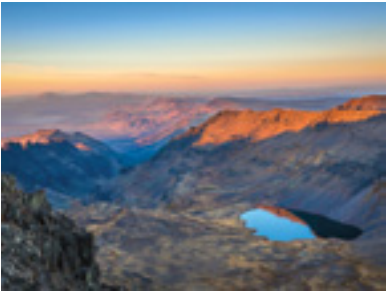
NOVEMBER STEENS MOUNTAIN