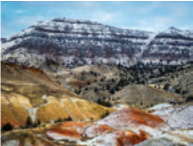
FEBRUARY SUTTON MOUNTAIN