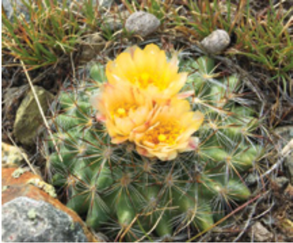
Hedgehog cactus, Pediocactus nigrispinus .

From my perspective, the desert is full, chock-a-block full of beauty, perspective, humility and patience – the stuff of life. True, there's greater biodiversity in a rain forest, ...but you won't find peace of mind in any greater quantity than when watching the sun rise in the desert, or more sanity than when you're watching it go down.