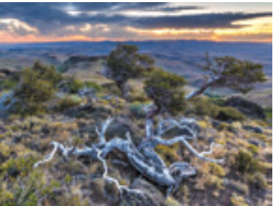
JULY TROUT CREEK MOUNTAINS