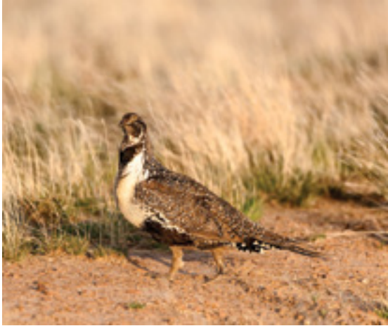
Greater sage-grouse.

I sat with a man in a cowboy hat in the pre-dawn cold and waited for a sage-grouse to come out from its shelter. And when it did, I looked at this cowboy/ rancher and saw that this bird, pillowed and strutting, had made the corners of the man's mustached mouth rise up, and his eyes squint, and the water in them glitter like a small diamond.